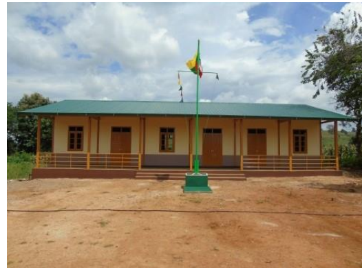
New School Building