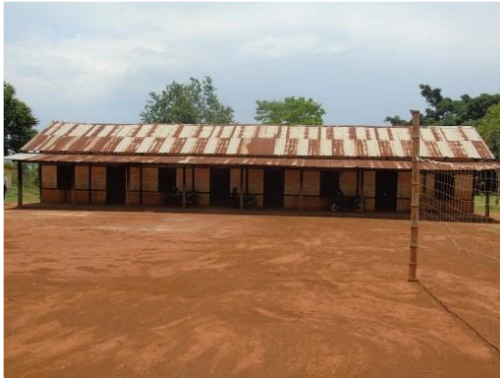
Old School Building

Myet Chin Nu Village, Myat Chin Nu Village Tract, Naungkhio Township,