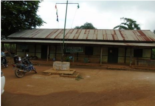
Old School Building

Haw Cone Village, Ngoke Kalay Village Tract, Naunghkio Township.