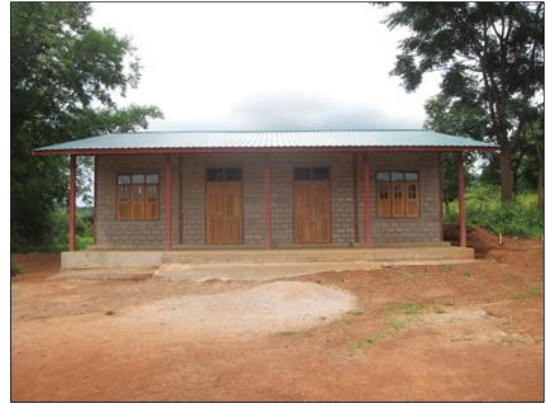
New school building measuring (40x30)ft