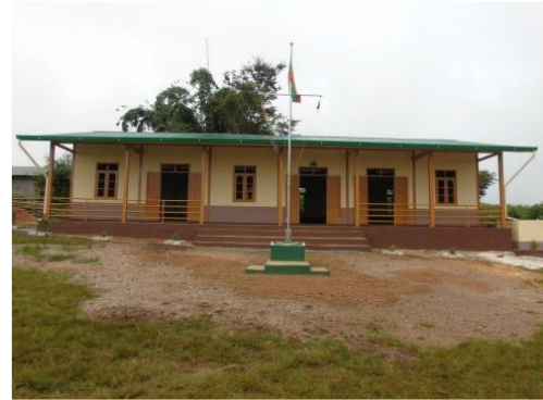
Newly constructed school building