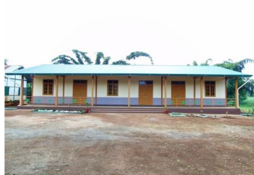
New School Building