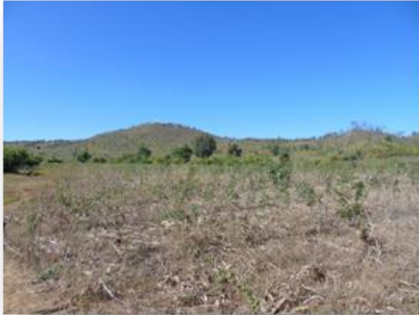
SII-25 Hsat Thay BEHS