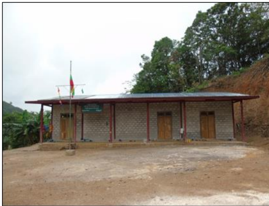
New School Building Construction