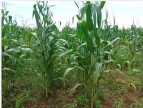
S-11 Hsat Thay Myay Mae BEMS (b)