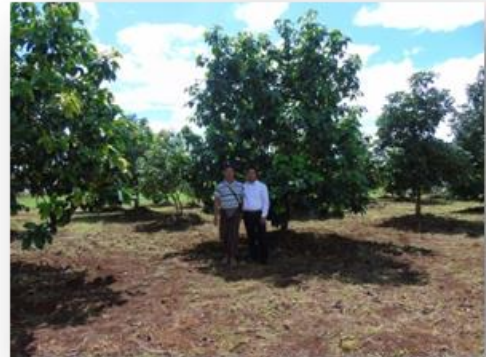
SII-7 Naung Khone BEPPS