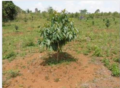
SIII-23 Kaung Waa Taung BEPPS