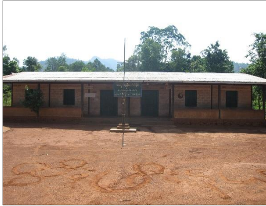
Old School building measuring( 60x 30)ft