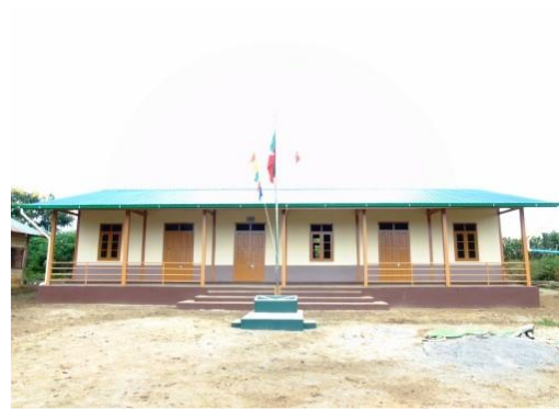
New School Building