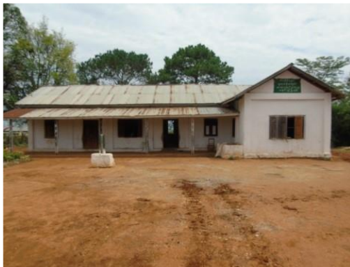
Old School Building