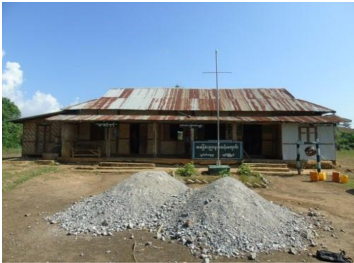
Old School Building

Loi Ngin Village, North Kongyi Village Tract, Naunghkio Township.