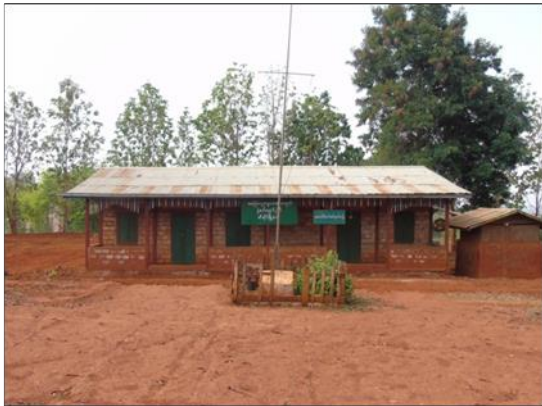
Old School building measuring (40x 30) ft