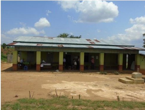
Old School Building

Thein Cone Village, Than Bo Village Tract, Naungkhio Township.