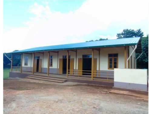
New School Building