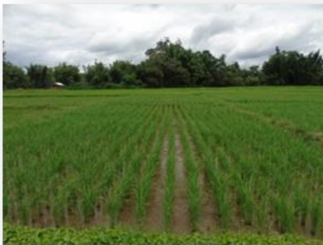
S-48 Kone Nyunt BEMS(b)