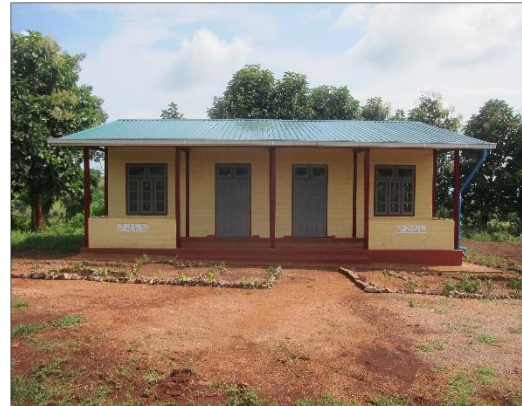
New school building measuring (60x 30) ft